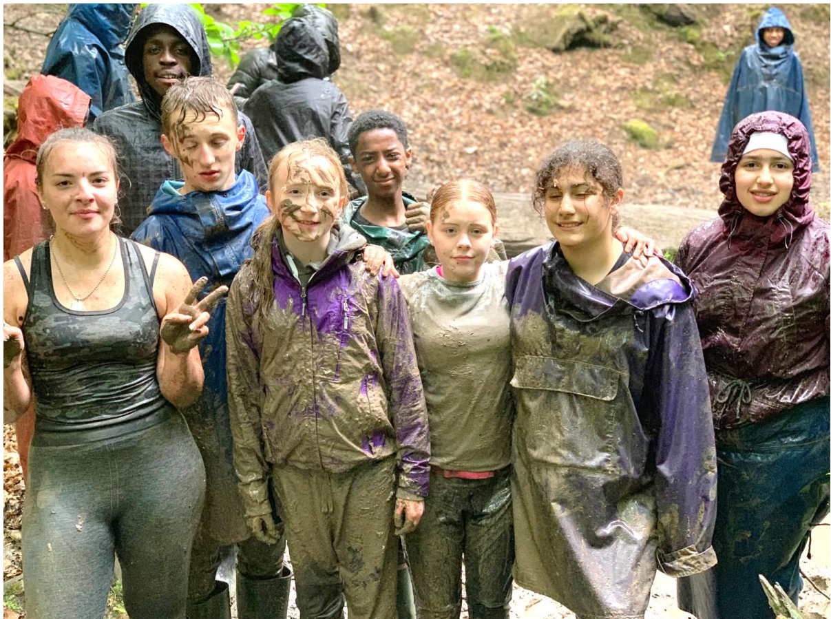
On my trip to Hindleap Warren I learnt: "How to be really muddy."